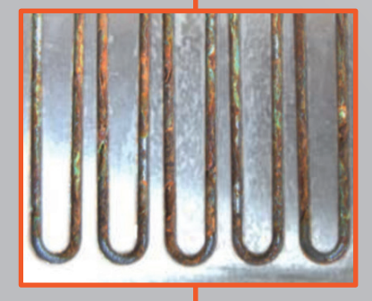
Pic 1: uncoated

Pic 2: With AnoxPro coating on tool steel 1.2709. After the salt spray test over 230 h with NaCl solution according to DIN EN ISO 9227 the result is clearly visible.